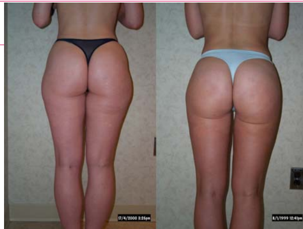
Image on the left is preoperative. image on the right is post liposuction of the hips and lateral thighs as well as medial thighs

Skin laxity could occur every where in the body when weight loss is significant. Lower body lift will then tighten